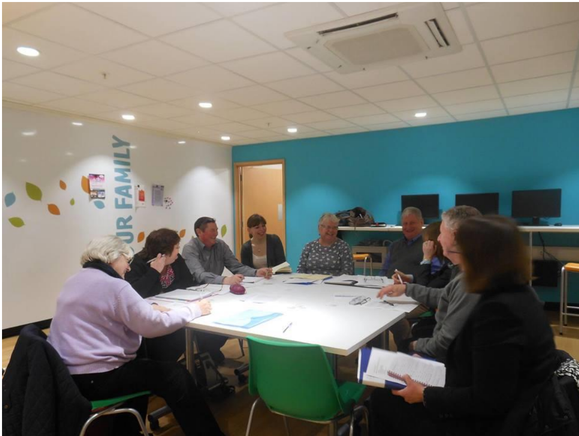
The board making use of the Tesco Community Room in Inverurie

This is The Garioch Partnership's fourth annual report since it was formed in January 2012. The Garioch Partnership (TGP) is a community-led organisation that uses its members' networks to build stronger, more successful, more sustainable communities in the Garioch Area of Aberdeenshire. It was granted charitable status in November 2012 and is recognised as a Scottish Charitable Incorporated Organisation (SCIO), Scottish Charity no: SC043548. It is governed by a Board of six trustees. It employs two development workers, one of whom is employed 21 hours/week, the other 18 hours/week, to support the partnership and its members, as well as the wider Garioch community. The second post was established in April 2014 in order to respond to the steady increase in demand from community organisations for support. Administrative support for TGP continues to be provided through an innovative partnership arrangement with Grampian Employment Opportunities (GO). Membership has grown during 2015/16 and there are currently 85 members, from a wide range of voluntary and community groups. All of the community councils in the Garioch area have joined the partnership.