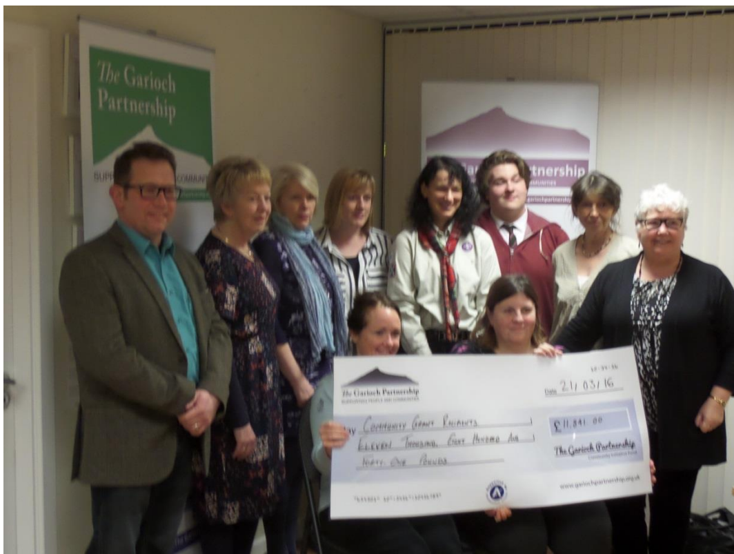
Successful applicants at our Spring Forum and awards ceremony in March 2016

To date TGP has been mainly funded by Aberdeenshire Council. The Council's investment this year (2015/16) was £37333. Most of this came from the Economic Development Service (£34333), with the balance from the Area Manager's budget. This budget is monitored through a Service Level Agreement (SLA) between the Council and the Partnership. In addition, as in the previous financial year 14/15, the Garioch Area Committee transferred £10000 to TGP from its Area Top-up Budget to fund the Community Initiative small grants scheme. Additional funding for specific pieces of work has been sourced from the Local Community Planning budget and Aberdeenshire Rural Partnership Federation for work on Community Action Plans, from Aberdeenshire CPP for the organisation of the Community Empowerment Conference with AVA, as well as the Health & Social Care Integration budget and the Scottish Rural Parliament for community engagement activity. The Board is actively seeking alternative income streams and innovative partnership arrangements in order to increase TGP's capacity to respond to the ongoing support needs of community groups in the area as they take on additional responsibilities for community economic development, service delivery and co-production.