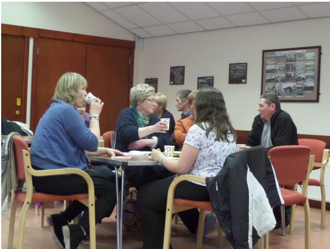
A typical community engagement session

The publication of the Community Empowerment Act in 2015 will have a significant impact on Community Planning in the years ahead as the CPP will be required to produce a Local Outcome Improvement Plan (LOIP). This will set out the local outcomes that the CPP will prioritise for improvement, as well as identifying smaller areas within the local authority area which experience the poorest outcomes. Locality plans to improve outcomes on agreed priorities for these smaller areas will need to be prepared and published. Active and effective participation by local communities is fundamental to this approach and the partnership is clearly well placed to support and contribute to these locality plans through the well-established community action plan process..