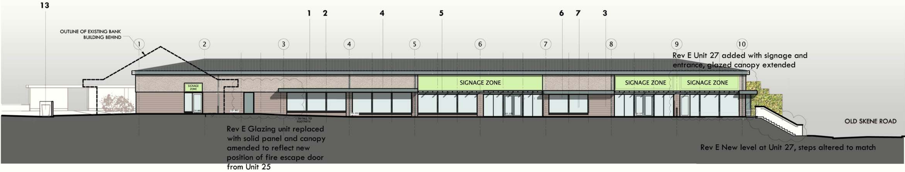
ELEVATION TO WEST