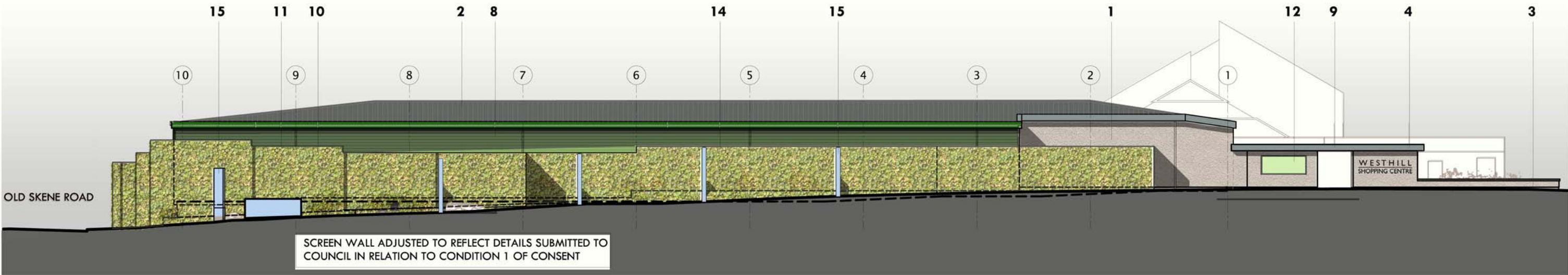
ELEVATION TO EAST